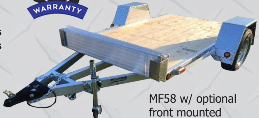
MF58 w/ optional front mounted ramps

14"/ 205-6 ply tires on 1-3500 lb axle w/ EZ-Lube hubs