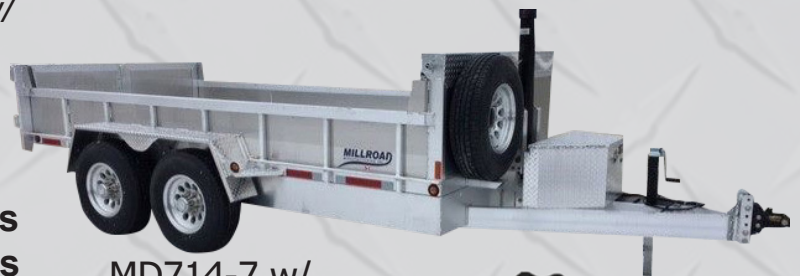
MD714-7 w/ mounted spare tire