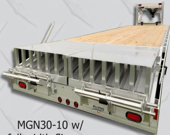
MGN30-10 w/ full width flip over ramps