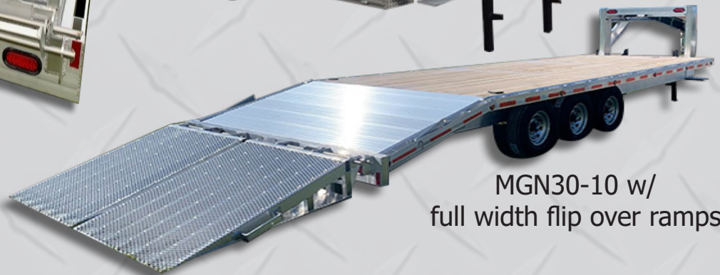
MGN30-10 w/ full width flip over ramps